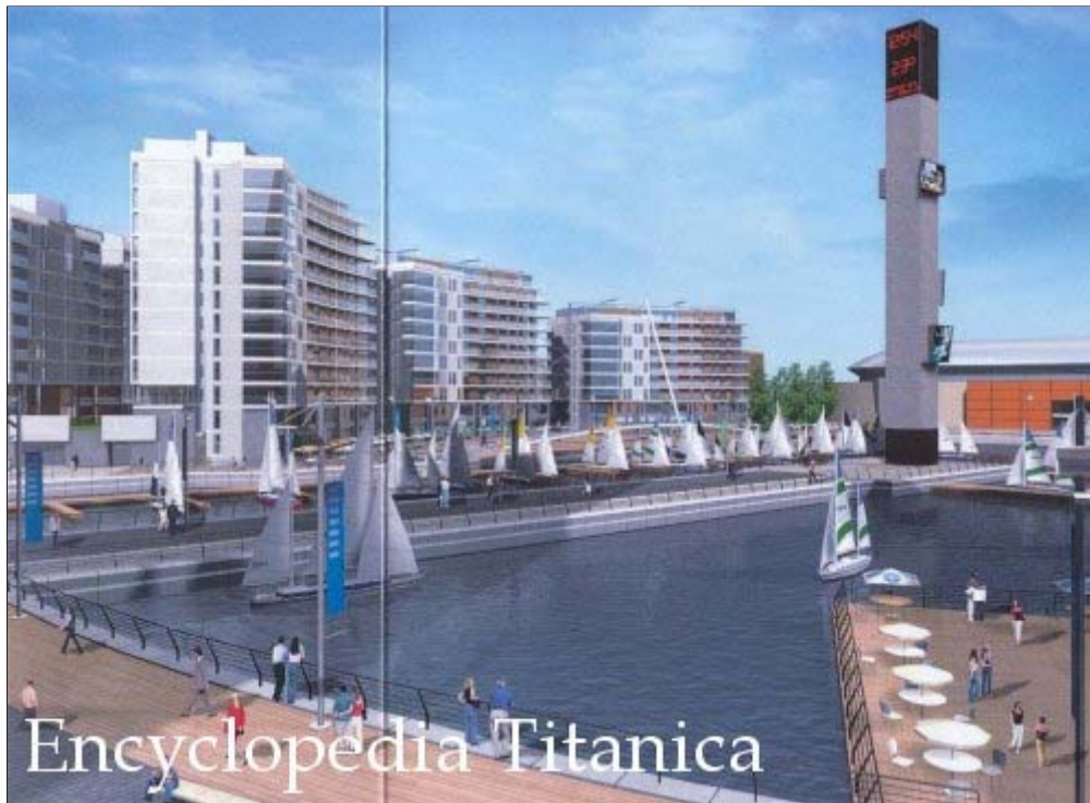
One element of the site concept, taken from a launch brochure.