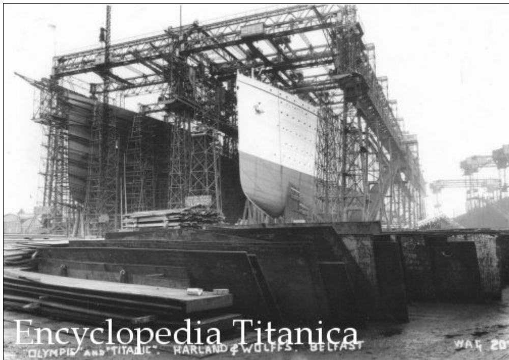
Titanic and Olympic side by side in the Arrol gantry. October 1910.

In the bottom right of picture are the Waterfront Hall and Hilton Hotel respectively, with the city centre to bottom left. At top of picture is Belfast city airport.